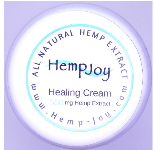
Sample Photo: Healing Cream 500 mg

Results valid for sample tested and metrologically traceable to an SI unit. LOD = 0.0433 ug/mL, LOQ = 0.2164 ug/mL or better. Chemistry values are presented by weight per cent within an error of 4.5% of the reported value with 95% confidence. Sampling per 16 CCR 42 Article 3, if required. Report shall not be reproduced except in full, without written approval from Coastal Analytical.